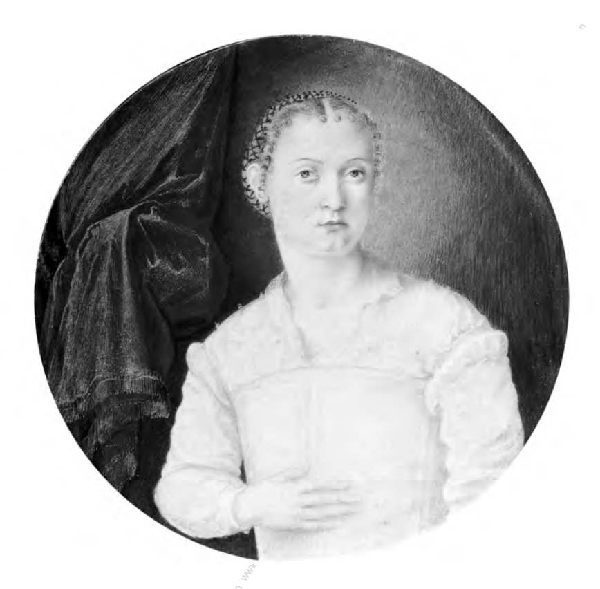
9.1 Giulio Clovio, Leonor de Toledo, Duchess of Florence , ca. 1552

British private collection since the mid-nineteenth century and the latter part of the Farnese Collection at the Museo del Capodimonte, and a self-portrait of Clovio probably painted in the 1560s for the Medici are the only extant conventional portraits by Clovio, but Vasari's account suggests that there were many others. He specifically mentions several in the Duke of Florence's study, perhaps best documented by the drawings of at least one of the Medici children attributed to Clovio. Besides confirming Vasari's account, Clovio's surviving portraits of the Medici also indicate the extent to which he fulfilled the typical duties of a court artist while residing with the Medici between 1551 and 1554. Certainly Clovio's talent was already well known in Spain by the 1550s; the fact that Leonor de Toledo was the cousin of the Duke and Duchess of Alba and sent them at least one Pietà would have furthered his fame. One can imagine that she might even have sent a small portrait of herself such as the one now in a British collection.