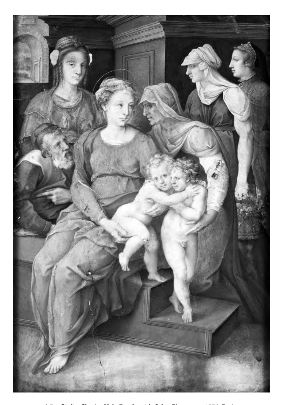
9.5 Giulio Clovio, Holy Family with Other Figures , ca. 1556, Paris, Musée Marmottan